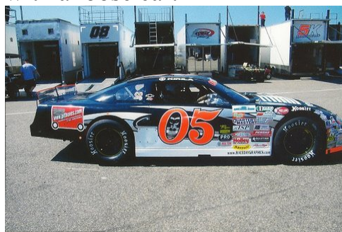
In the pits by the David Stremme Racing hauler