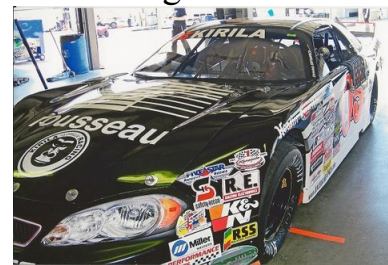
#05 in the garage

lap 45. There was a competition caution at lap 50 to change tires and make additional adjustments. He was not feeling really comfortable with the handling of the car, but at this larger track, there were many new factors to get used to.